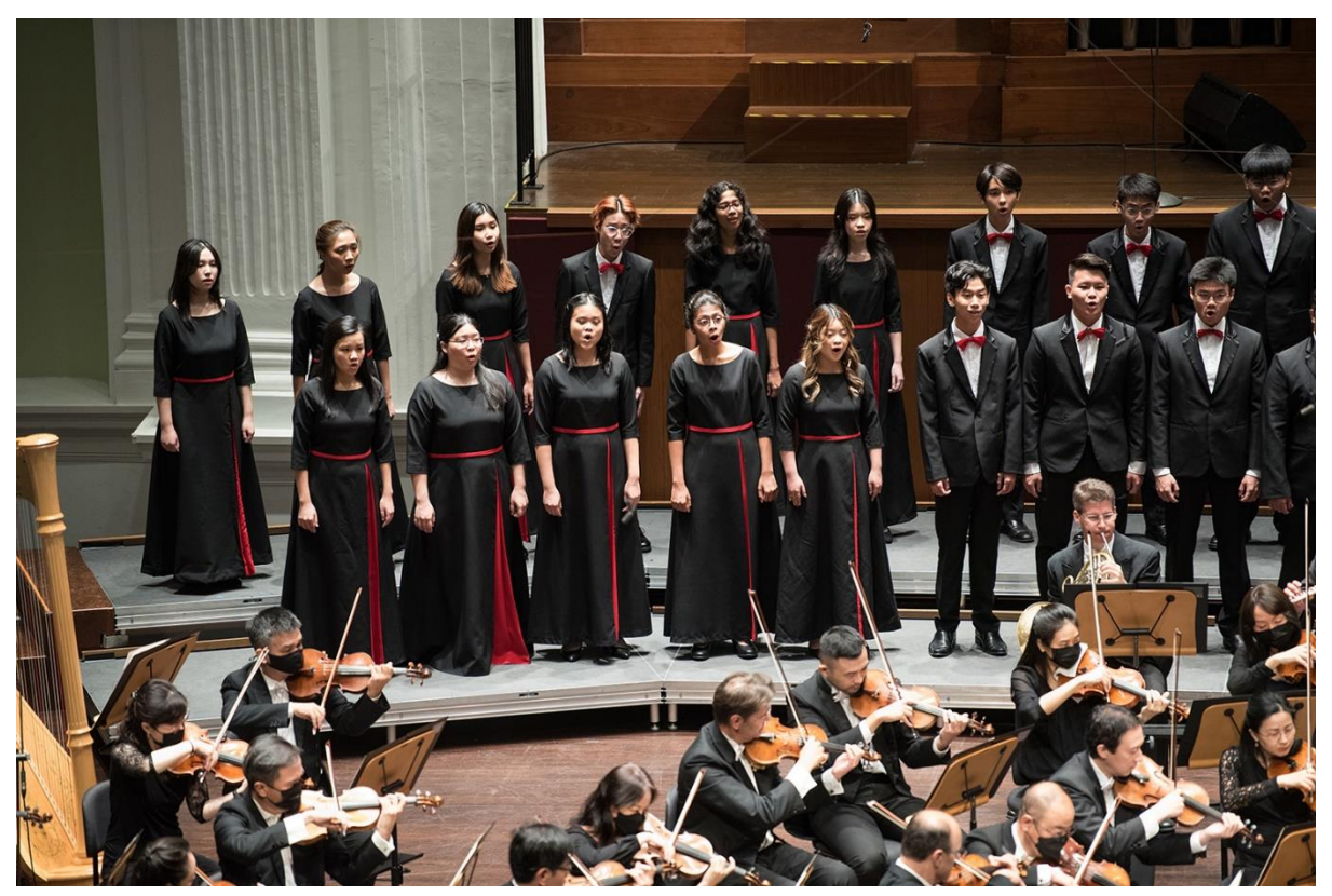
SSYC with SSO, VCH, 16 Sep '22

As an ambassador of the Singapore Symphony Youth Choir and an affiliate of the Singapore Symphony Group (SSG), one's conduct is a direct reflection on the establishment. Members are expected to demonstrate professionalism at all times.