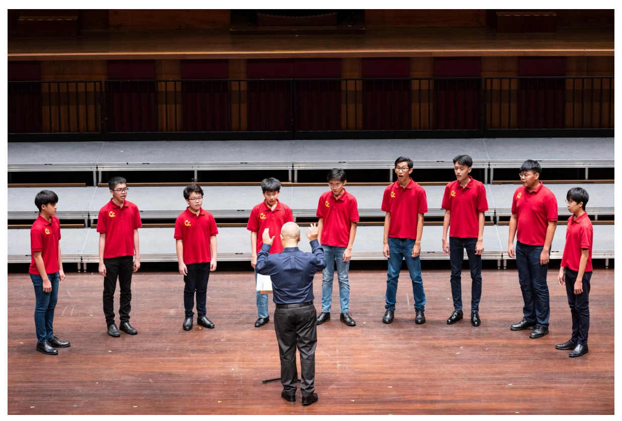
Our Boys' Ensemble at the SSCC-TW x SNYS Presentation Concert, Victoria Concert Hall, 20 Nov '22