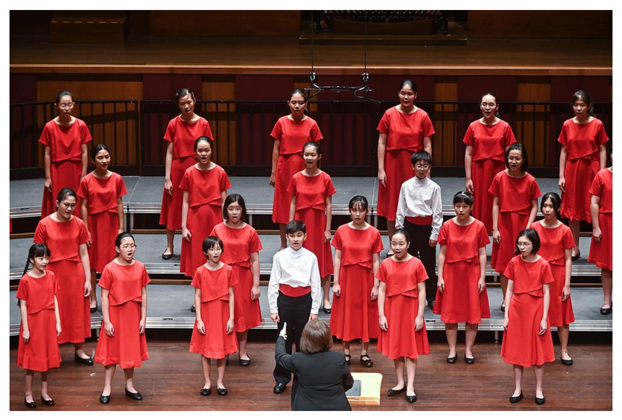
Singapore Symphony Choruses Recital, Victoria Concert Hall, 29 May '22