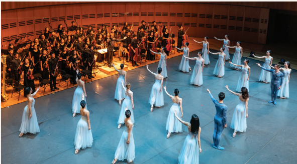
Singapore National Youth Orchestra Nurture the next generation of musicians through development opportunities with professionals.