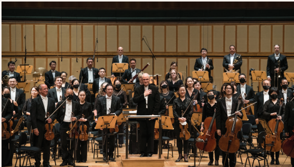
Singapore Symphony Orchestra Build an outstanding line-up of performances at the historic Victoria Concert Hall and world-renowned Esplanade Concert Hall.

Artistic excellence across all SSG performing entities