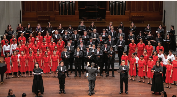
Singapore Symphony Choruses Foster passion for classical choral singing through our premier body of three choruses that provide platforms for training and performance at the highest level.

Diverse communities impacted deeply and meaningfully by music